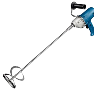
Slow Speed Mixer