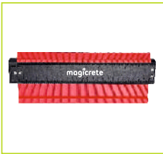
Plastic Tile Shape Template