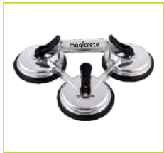
Heavy Duty Section Cup Triple Drum