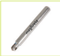
Pencil-type Cutter Wheel