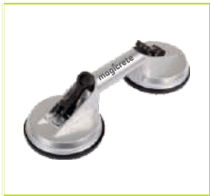
Heavy Duty Suction Cup - Twin Drum