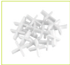
Tile Spacer (Available in 2, 3, 4, 5, 8 and 10 mm)